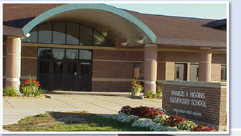
Francis A. Higgins Elementary School

L'Anse Creuse Middle School – Central Addition