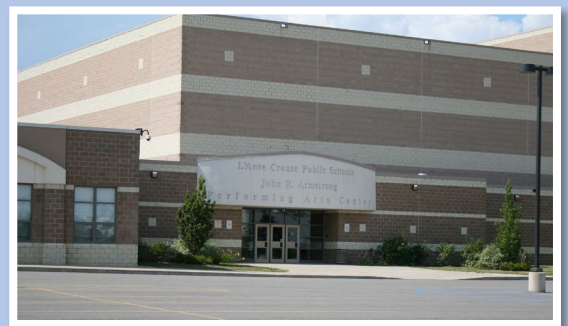
Performing Arts Center