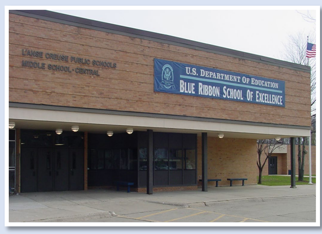
L'Anse Creuse Middle School – Central