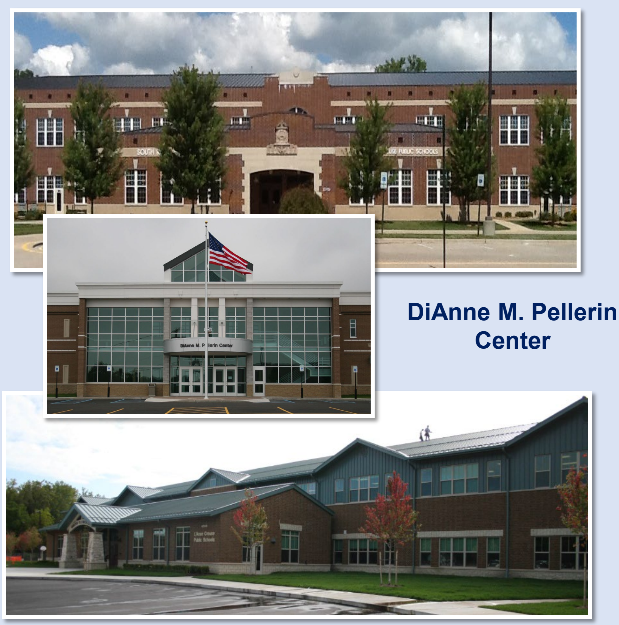
Green Elementary School Remodel