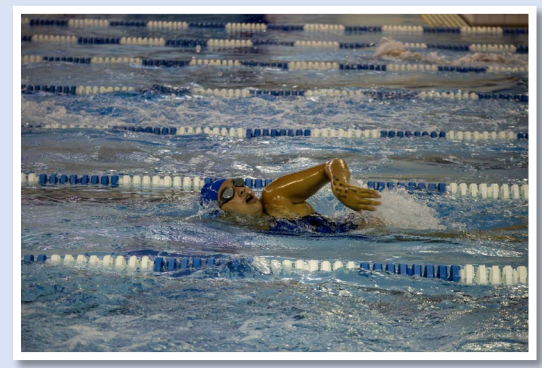
High School Pools