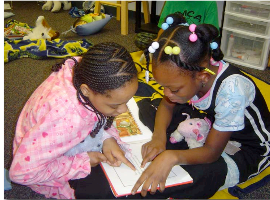
Reading is fun when shared with friends!

To assure that our instructional program is effective, we compare scores on student achievement tests over time. We are proud to report that our district has made adequate yearly progress in both English Language Arts and Mathematics as determined by the Michigan Department of Education.