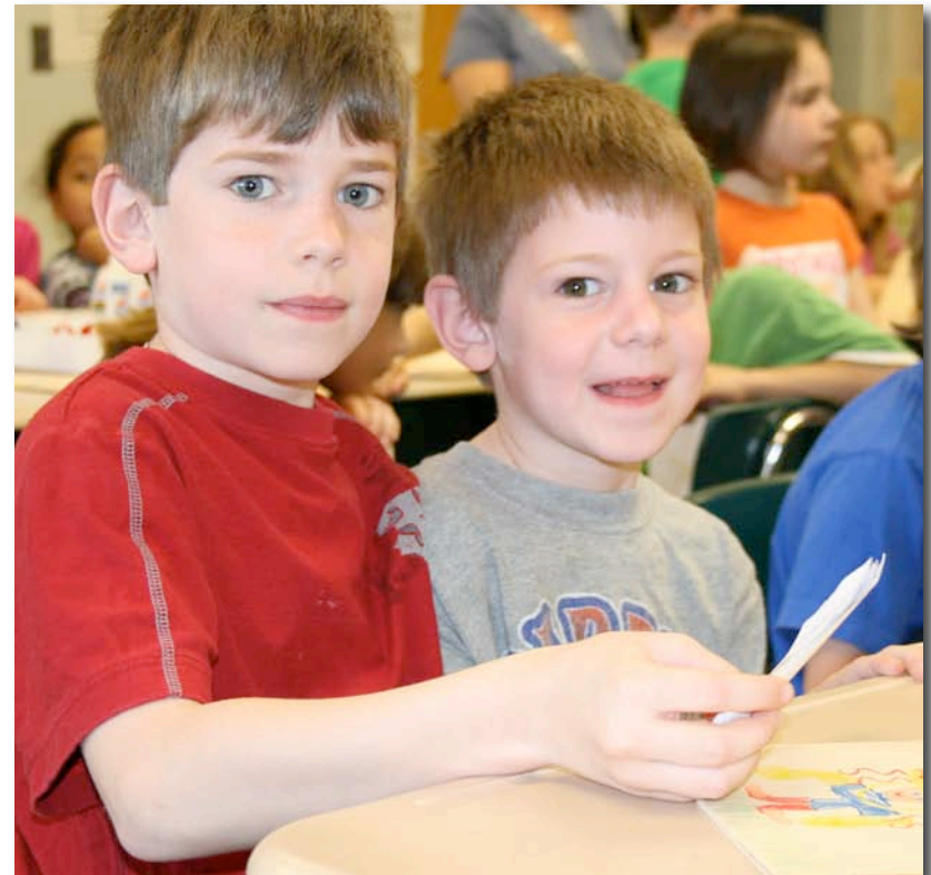
At Higgins Elementary School, second-graders read in Spanish to kindergartners.